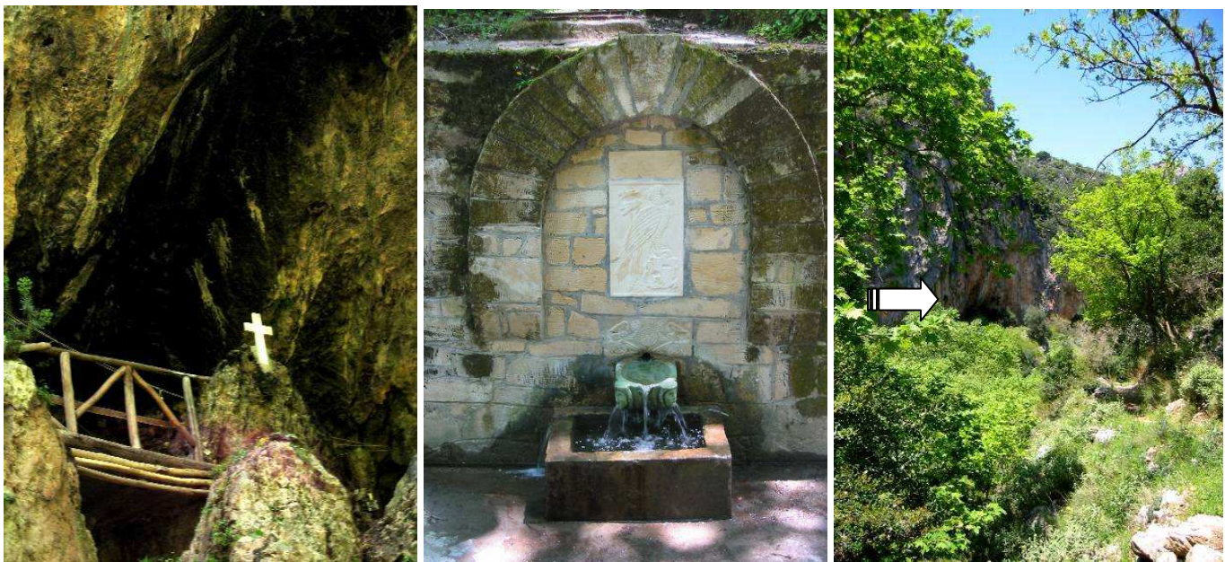
The left figure shows the "bridge" to the chapel in the entrance to the cave. The centre image shows the today lined "Hermes spring". It is located below the left shown Chapel cross on the ground of the canyon. The figure to the right shows the access to the Fournare cave.