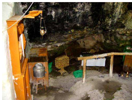
Figure left shows the access to the chapel from the cave entrance. Fig. right shows the chapel hall inside the karst cave.