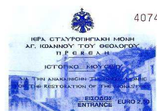
Views of the Monastery Preveli: left, the renovated part with church, besides a old building row.