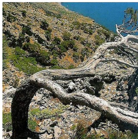
The figure left shows the trail from Sternes to Koudoumà .