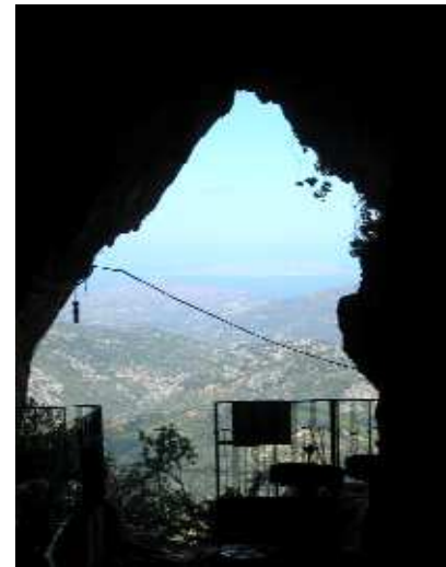
Picture left: the upper half of the dominating, white sinter-column in the “sanctuary area”. Centre picture shows a holy water font, approximately in the center of the area of the cave church. It is fed (also) by dripping water from the cave ceiling. Already during the “old” Greek times, containers with consecrated water were situated at the entrance of holy areas; the right picture shows the “cave exit” from the inside