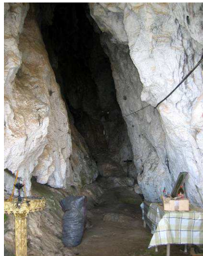
Images showing (from left to right): view at Avdou seen from cave forecourt, the cave entrance and the entrance area.